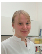
Authors: Keith F Cutting Peter Vowden Cornelia Wiegand

Temporary inflammation is a normal response in acute wound healing. However, in chronic wounds, the inflammatory phase is dysfunctional in nature. This results in delayed healing, and causes further problems such as increased pain, odour and high levels of exudate production. It is important to choose a dressing that addresses all of these factors while meeting the patient's needs. Multifunctional polymeric membrane dressings (e.g. PolyMem ® , Ferris) can help to simplify this choice and assist healthcare professionals in chronic wound care. The unique actions of PolyMem ® have been proven to reduce and prevent inflammation, swelling, bruising and pain to promote rapid healing, working in the deep tissues beneath the skin [1,2] .