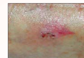
CLOSED IN 6½ WEEKS