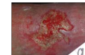
PAIN FREE IN 9 DAYS