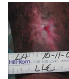
October 11 1.5 cm x 1.3 cm x 0.1 cm Lateral wound: 3 cm x 2.5 cm Posterior wound: 3 cm x 3 cm x 0.2 cm Cleansed the periwound area only.