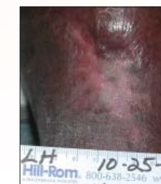
CLOSED IN 6 WEEKS