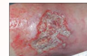
TREATMENT INITIATION CONSTANT PAIN