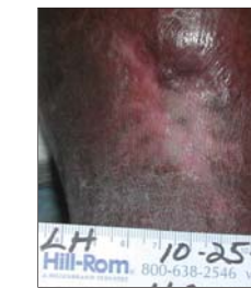
October 25 Fully closed at 6 weeks. Lateral wound closed October 18. Posterior wound: 2 cm x 1.5 cm x 0.1 cm Refused compression but still closed November 29.

Patient 3: An 87-yr-old female with hypertension, hyponatremia, hypothyroidism, osteoporosis, SIADH, GERD and seizures had a painful venous ulcer treated unsuccessfully with wet-to-dry dressings for 2 months.