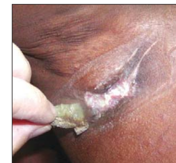
Figure 7 Feb 20 - Complete closure is imminent; transportation to TB treatment facility arranged.

Linda Benskin, RN, BSN, Ghana SRN, Church of Christ Mission Clinic, P.O. Box 137, Yendi, Northern Region, GHANA, West Africa