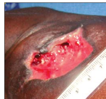
Figure 5 Dec 4 - The TB-infected lymph tissue was repeatedly removed, leaving deep holes; PolyMem Wic Silver provided effective pain relief.