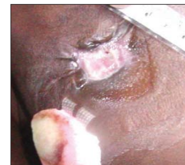
Figure 6 Jan 17 - Healing well. No surface infection or inflammation, so silver dressings are not needed.