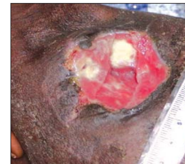
Figure 3 Nov 25 - Already granulating, but lymph TB is rapidly regrowing in the wound bed.