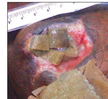
Figure 4 Dec 1 - The dressings could be cut to fill dead space in virtually any shape. (Pain Relief)